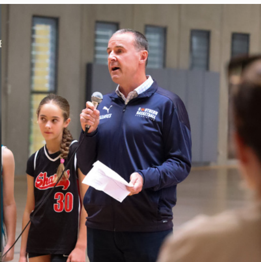
SATURDAY 3RD FEBRUARY 2024