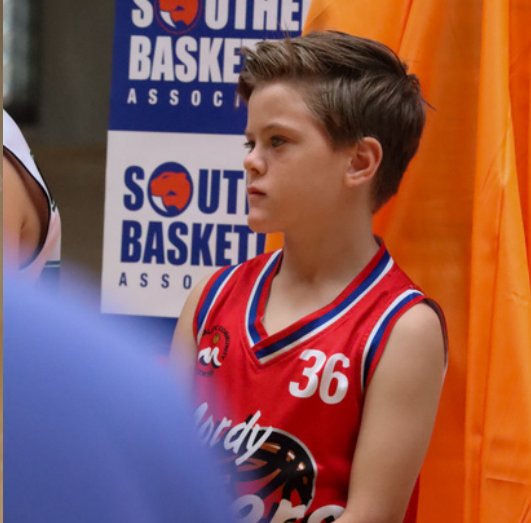
SOUTHERN BASKETBALL ASSOCIATION NEW COURTS LAUNCH